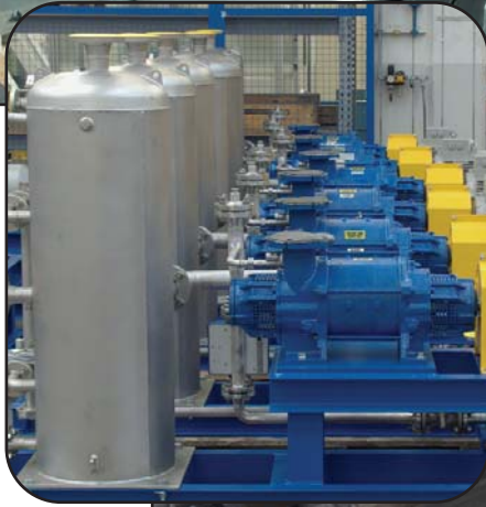
XL45 packages for evaporator milk service in Thailand