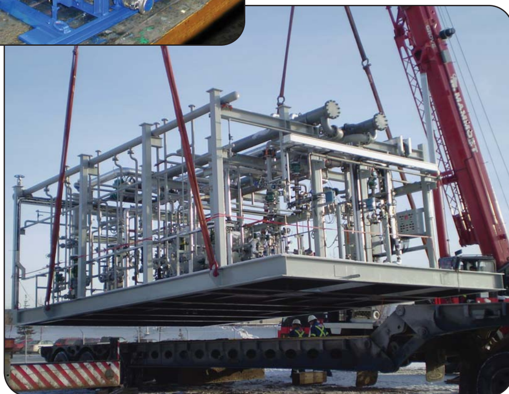
A duplex 2BG1151 compressor system for a customer in the Cold Lake Tar Sands area of Alberta. It will be used for vapor recovery at a tank farm.