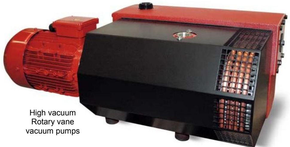
High vacuum Rotary vane vacuum pumps

A large range of Rotary Vane vacuum pumps are marketed by Vac-Cent. Rotary Vane or Sliding Vane pumps are used in very high and ultra high vacuum processes. Pump size range in Volume from 15 m 3 /Hr to over 1000m 3 /Hr in a single pump.