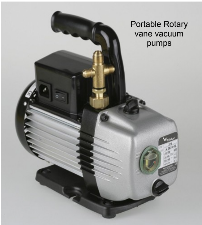
Portable Rotary vane vacuum pumps