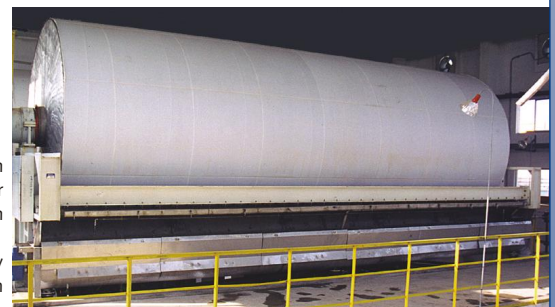
Rotary Drum Precoat Filter System