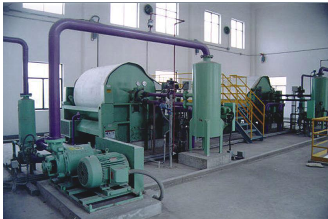
Drum Filter Vacuum System