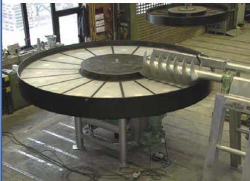
Tray Filter Vacuum System

Phosphate Chemical processing Mining and mineral processing